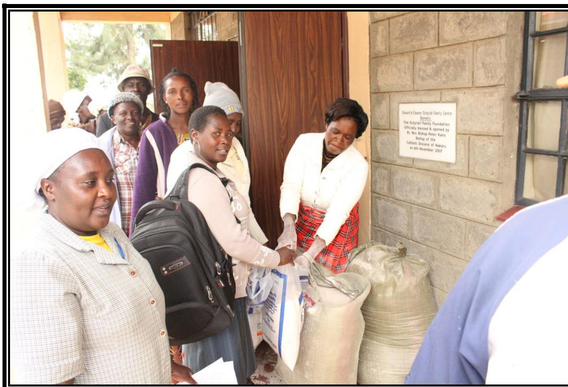
ASN Upendo Village cateress distributing cereals as part of the monthly food donation during support group meeting for clients.