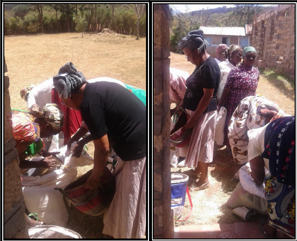
Grandmothers receiving nutritional supplements during their meeting at Maai-Mahiu

The table below shows the attendance of both Town and Maai Mahiu grandmothers during the period under review.